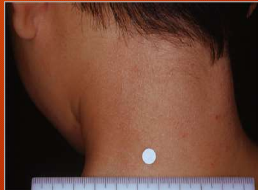
End of study – week