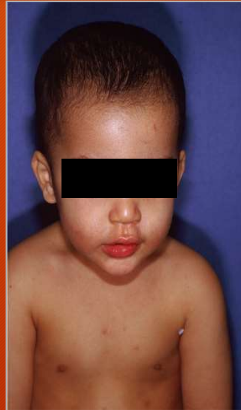
End of study – Week 6