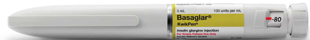
Not actual size.

The prefilled BASAGLAR ® KwikPen ® dials up to 80 units. If you are using BASAGLAR ® cartridges, the SAVVIO ™ reusable insulin pen dials up to 60 units. Make sure you check the dose before injecting.