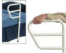
Side Bed Rail