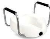
Toilet Seat with Arm Rest