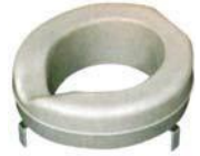
Raised Toilet Seat