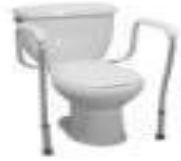
Over-Arm Toilet Bar